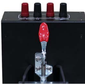
banana socket panel & clamp lever